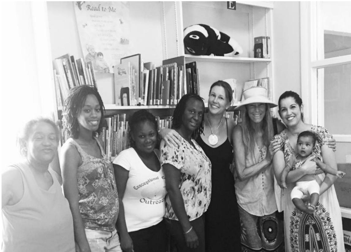
EEO staff gathering at library to plan for upcoming school year....

It is going to be another great school year for the children of Harbour Island and Eleuthera. EEO's outreach efforts include critically needed therapist visits, daily in-school instruction in 5 public schools and a seminar series to provide training with latest strategies for special needs and literacy challenges.